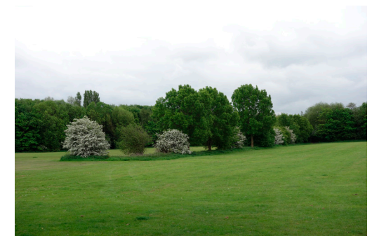
Turn Moss Playing Fields