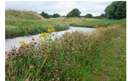
The River Mersey