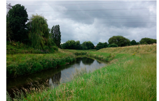
The River Mersey

4 Trans Pennine Trail: A national route that stretches across northern England, from Hornsea to Southport. The trail is part of the E8 long distance route which links Cork in Ireland to Istanbul in Turkey.