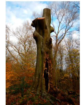
Pollarded heritage beech