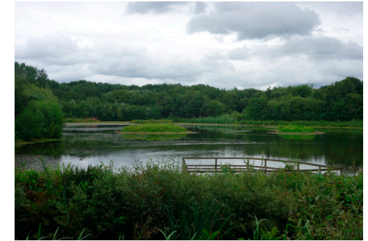
Broad Ees Dole

5 Heritage Beeches: Enjoy the 'avenue' of mature beech trees within Priory Gardens. Look out for the fire damaged beech which continues to support wildlife, including interesting fungi.