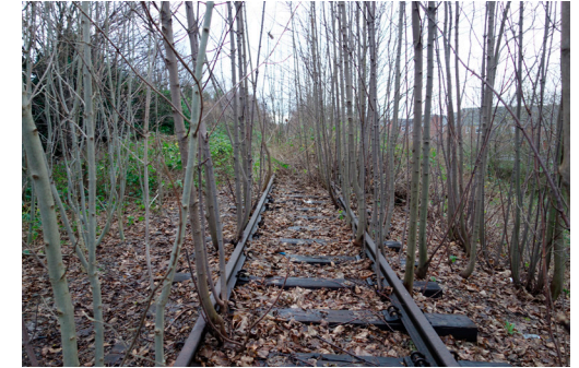
Old railway line

4 Giant Sequoia: This native tree of California typically grows on the western slopes of the Sierra Nevada. It was introduced to the UK in 1853 and can live more than 300 years. It is the largest known tree species on earth.