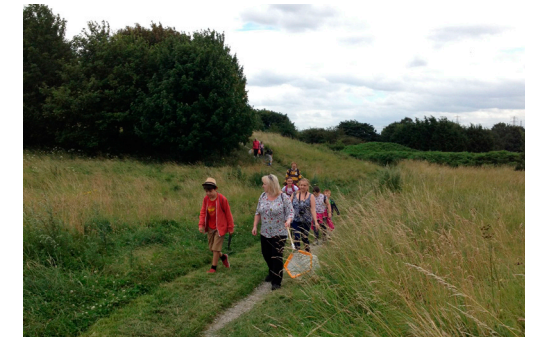
Butterfly Picnic walk

4 Jack Lane Nature Reserve: This small marshland habitat supports a rich variety of wetland birds and other species, including sedge and reed warblers. The old sewage works nearby are an important undisturbed site for wildfowl in winter, and migratory birds in spring and autumn.