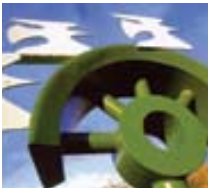
Waterwheel by David Kemp 1996

This sculpture is found at the main entrance to the park. The wheel symbolises the process of constant change - the changing of the river into an industrial site and