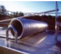
Picnic Area by David Fryer 1998

quarried for use in the construction of a bridge and in places the mason marks can still be seen. The carved symbols and pictures were added by the artist as clues to long forgotten stories.