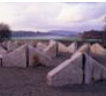
Stone Cycle by Julie Edwards 1997

The broken circular layout of the piece signifies the passing of time, people and industry and the subsequent re-invention of the area. The stones were originally