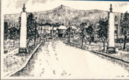
Lever Park Avenue