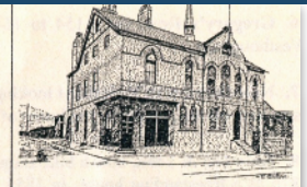
The Public Hall