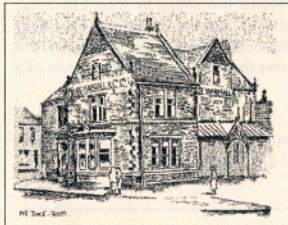
The Crown Hotel