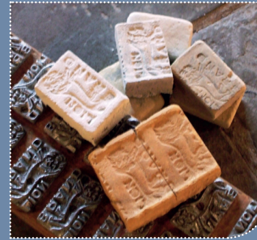
Find out more about Donkey Stones in Portland Basin Museum.

At this point the Huddersfield Narrow Canal begins its 20 mile journey to Huddersfield.