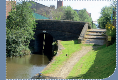
The Huddersfield Narrow Canal was completed in 1811. It was to provide a more direct route from Manchester to Leeds. Today it is a haven for wildlife.