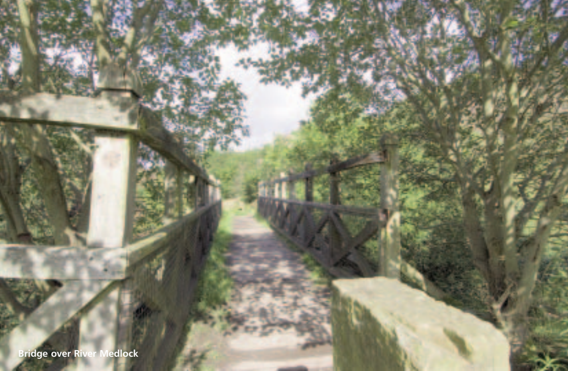
Bridge over River Medlock

⑫ Turn right and follow the towpath all the way to the bridge under the A627 Oldham/Ashton Road.