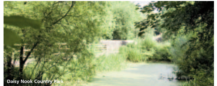
Daisy Nook Country Park