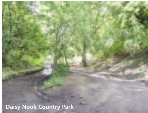
Daisy Nook Country Park