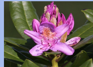
They may look pretty but these shrubs reduce biodiversity

Along the trail you will pass through several UK Priority Biodiversity Habitats.