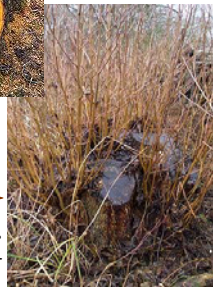
▶ The same Alder stool after one year's re-growth.

Typically a coppiced woodland is harvested in sections or coups on a rotation. Coppicing has the effect of providing a rich variety of habitats, as the woodland always has a range of different-aged coppice growing in it, which is beneficial for biodiversity.