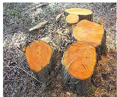
◀ a recently coppiced Alder stool.

Coppicing is a traditional method of woodland management which takes advantage of the fact that many trees make new growth from the stump or roots if cut down. In a coppiced wood, young tree stems are repeatedly cut down to near ground level. In subsequent growth years, many new shoots will emerge and after a number of years the coppiced tree, or stool, is ready to be harvested, and the cycle begins again. (The noun "coppice" means a growth of small trees or a forest coming from shoots or suckers.)