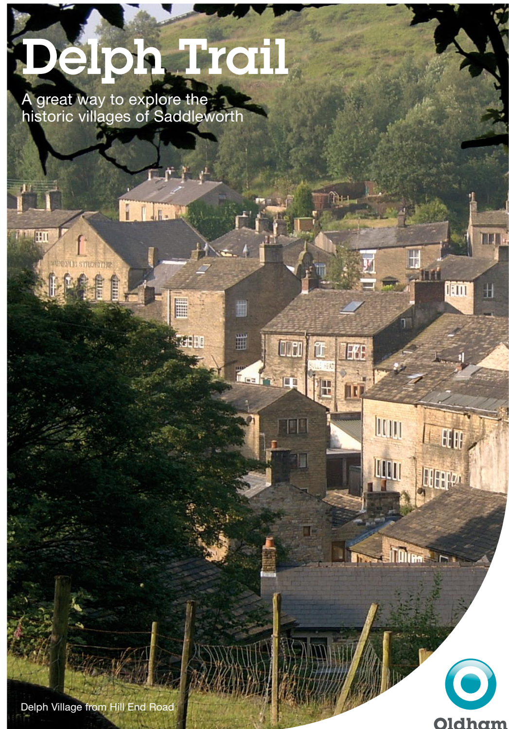
Delph Village from Hill End Road

A great way to explore the historic villages of Saddleworth