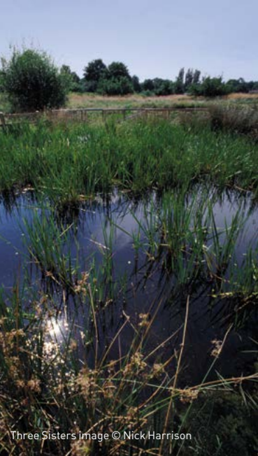
Three Sisters image © Nick Harrison

From the train station at Eccles, turn right and walk over the motorway in the glass bridge, then cross over and walk straight up Clarendon Road. At the end, cross over and follow the alleyway left of Clarendon Garden, marked Cycle Route 55. Follow this route, across the next road and through the houses, along Ellesmere Road to the junction with Stafford Road. Turn right, walk to the end and at the corner bear left along the path through the Three Sisters Nature Reserve. This is a lovely spot for a break and picnic, overlooking the ponds.