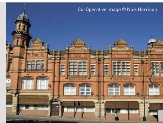
Co-Operative image

Pass Patricroft Train Station and take the grim looking path just after it on your left. Continue up here to Hampden Grove, follow this road alongside the railway line until it turns into a footpath again. Continue along the side of the railway line, under the high brick wall of the old Co-operative building, until the path finally ends onto Old Wellington Road.