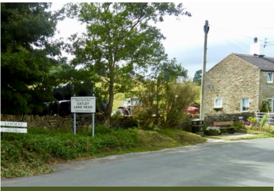
A - Catley Lane Head – ROUTE START