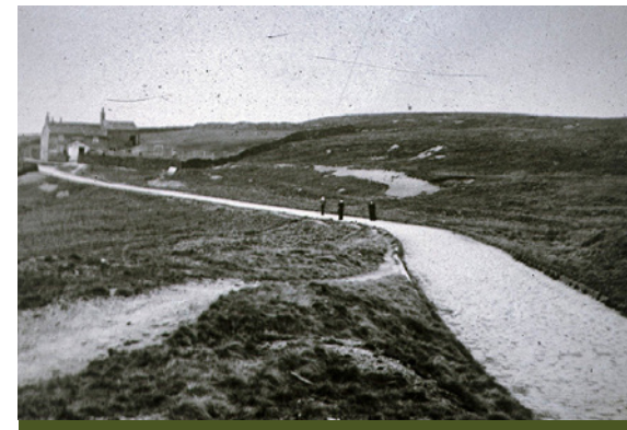
K - The Moorcock Inn – only a few ruins now visible