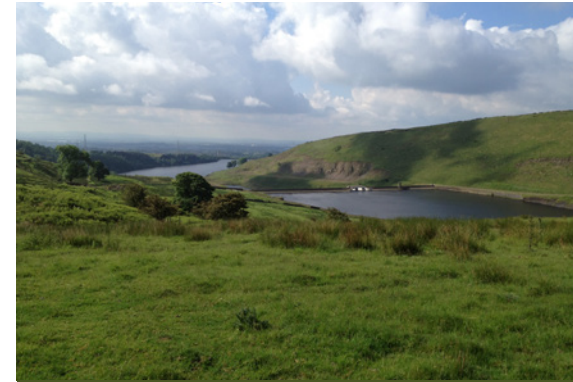
L - Views Across Greenbooth From Reddishore Top