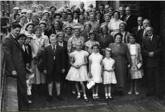
D - Closing Ceremony – Lane Head Methodist Chapel