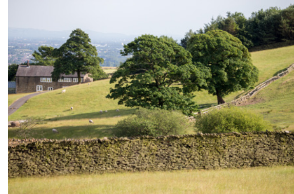
O - Hunger Hill Farm (nearby)