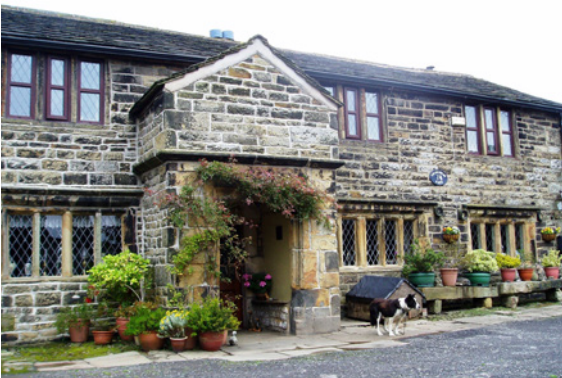
F - Smallshaw Farm - listed building